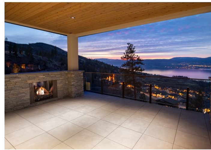
Luxury retreat: deck, fireplace, stunning lake views