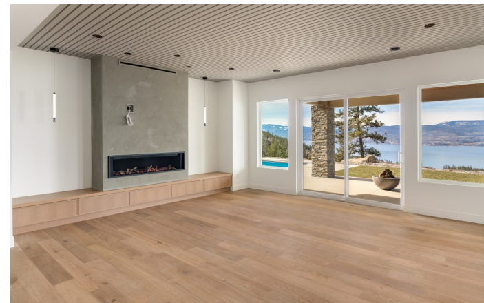
Lower level family room with access to pool