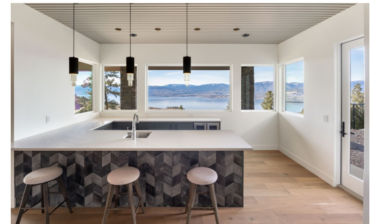
Lower Level wet bar, ideal for entertaining