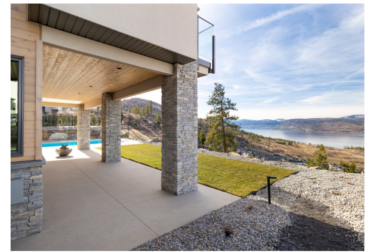
Opulent oasis: pool, patio, fire table, lavish relaxation