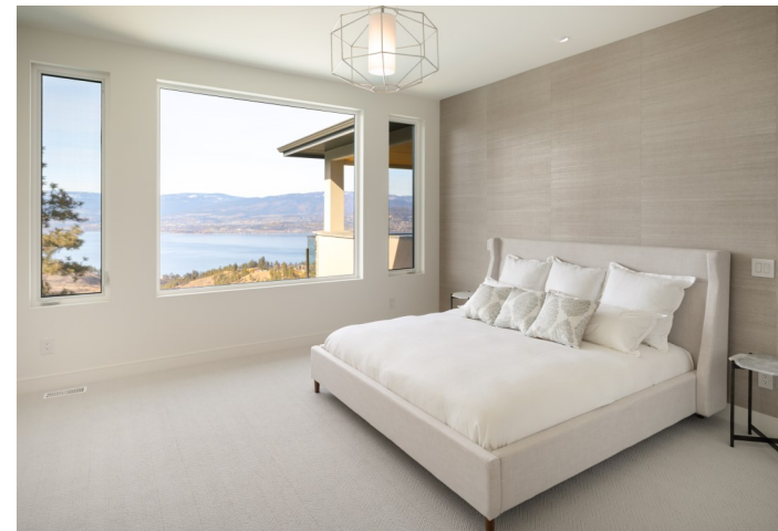
Expansive Primary Bedroom